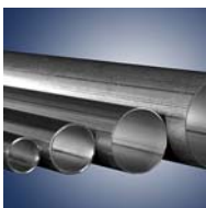
Longitudinal seam welding of thin walled pipes