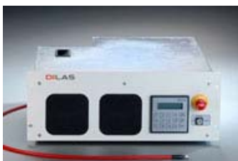
COMPACT Diode Laser System

The COMPACT is a diode laser system in a standard 19-inch format. The modular concept enables the integration of various diode laser modules with output powers of up to 500W with a standardized interface and footprint.