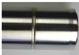
High optical weld quality